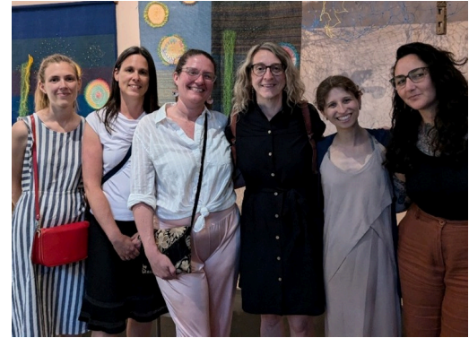
Members of the Museum's Sustainable Development Committee – Green class at the Biosphère, June 2024

In response to last year's audit, an action plan was drawn up to reduce the Museum's use of plastic. In addition to the awareness-raising measures introduced, various avenues for reducing plastic consumption were identified. Three ad hoc subcommittees were created to kick off the initiative: Waste Management Policy; Reduction of Single-Use Plastics; and Waste-Sorting Awareness Campaign.