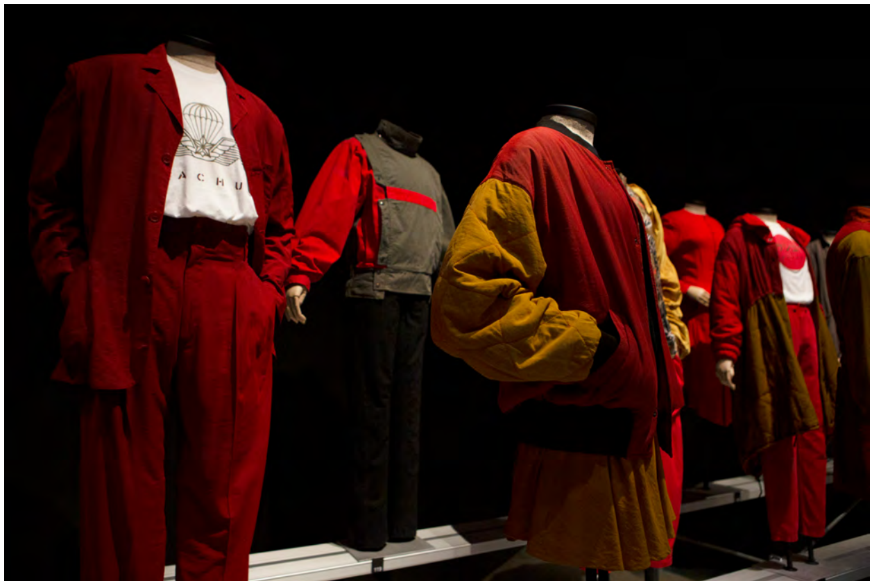
Roger Aziz