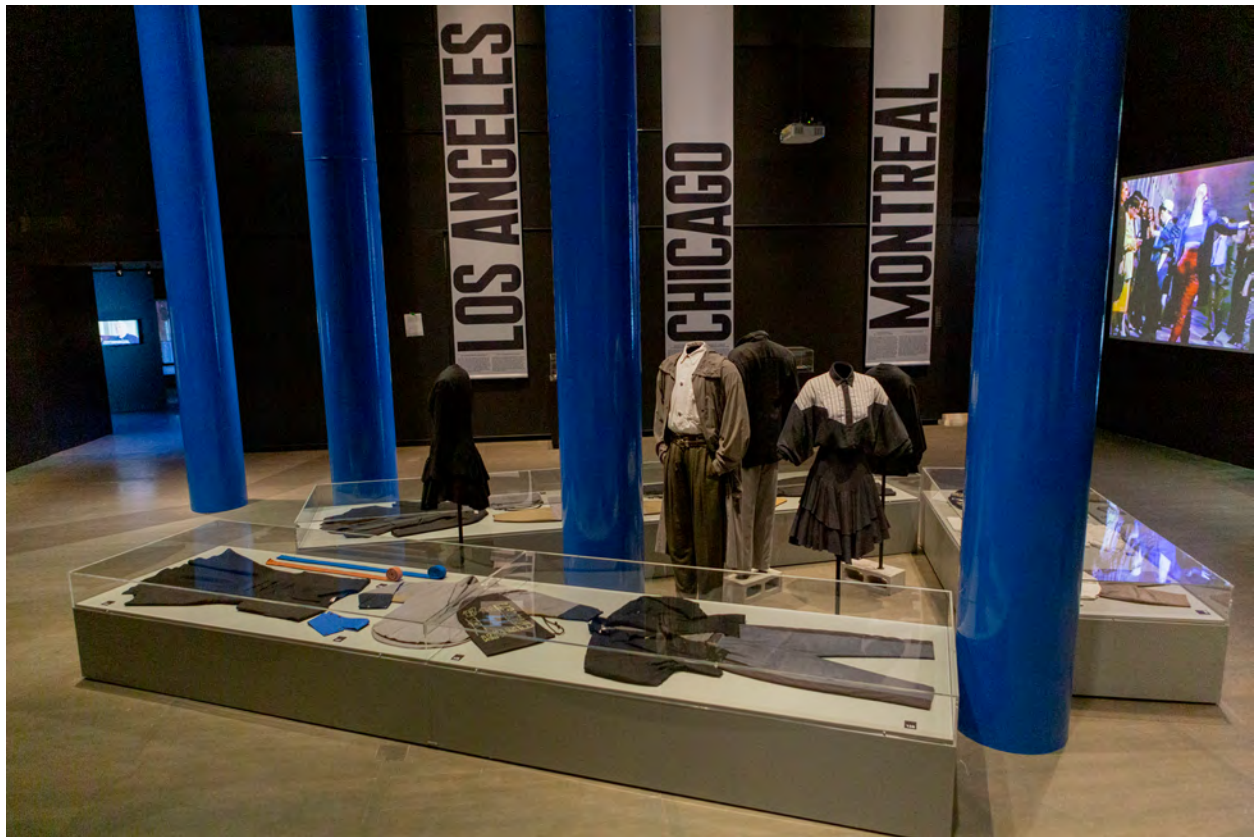
Roger Aziz