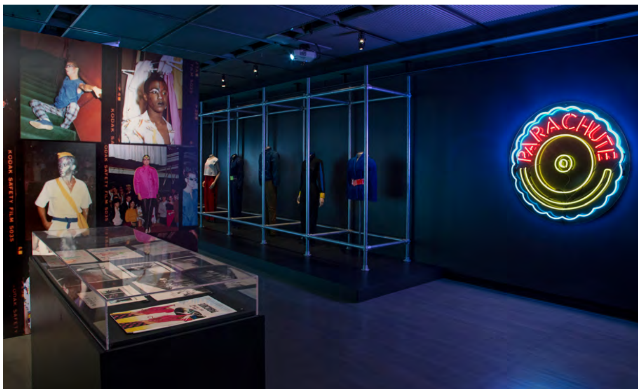
Marilyn Aitken © McCord Museum