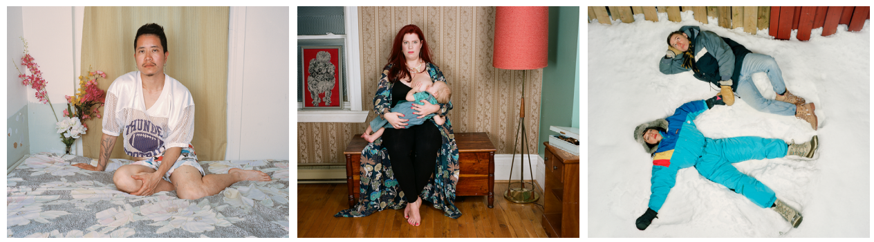
Felix 2015, © JJ Levine