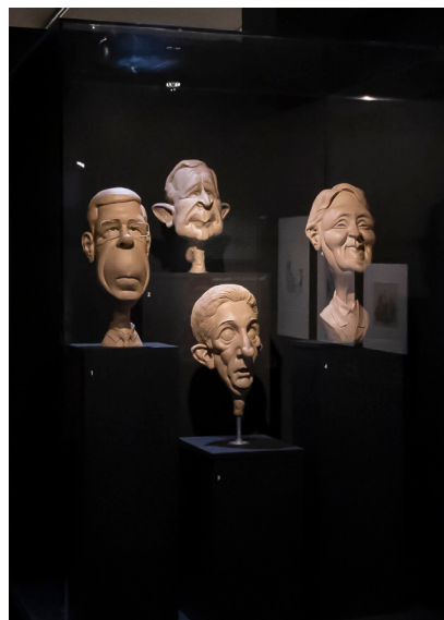
Exhibition Chapleau