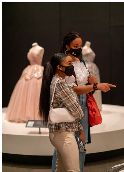
Exhibition Christian Dior