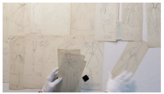
The Drawings of Christian Diorr, 2017, Loïc Prigent.