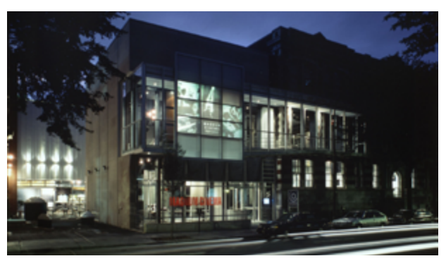
Adapting existing built forms: clash, contrats or continuity?