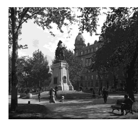
Dominion Square, Montreal, QC, 1915 Wm. Notman & Son 1915, 20th century

The McCord Museum wishes to thank the Ministère de la Culture, des Communications et de la Condition féminine du Québec and the Conseil des arts de Montréal.