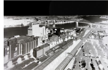
St. Lawrence River, Jacques Cartier Bridge and Molson Brewery, Montreal, 2005, Collection of the artist

The McCord Museum thanks the Ministère de la Culture, des Communications et de la Condition féminine du Québec, the Conseil des arts de Montréal and its partners: UMA, la Maison de l'image et de la photographie, Astral and The Gazette .