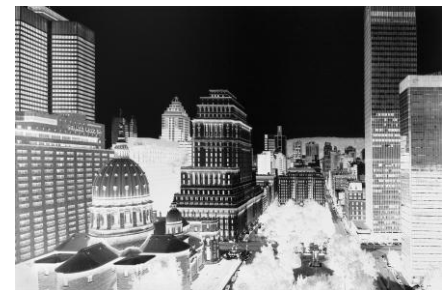
Guy Glorieux, Sun Life Building and Dorchester Square, Montreal, 2008, Collection of the artist

These photos depict reality in an unusual way that at times can be overwhelming. Visitors may recognize some of the places in the photos, but without being entirely certain. They will see the reflection of a car in the frame just long enough to leave a trace of its passage, or the branches of a tree swaying in the wind. They'll wonder about what they are seeing and draw on their own memory to recognize the lateral inversion produced by the pinhole camera. Impressions of a City, Montreal Through a Pinhole , features stunning images and an exploration of the notion of time in a city.