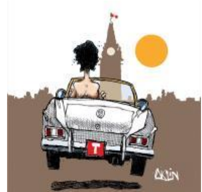
Justin Trudeau, Zoomer Magazine, décembre 2016.