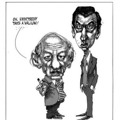
OK, everybody take a valium! Montreal Gazette , November 16, 1976 Gift: Terry Mosher, P090-A/50-1004