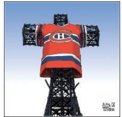
Croix du mont Royal, Montreal Gazette, March 13, 2008. Gift: Terry Mosher M2016.28.5