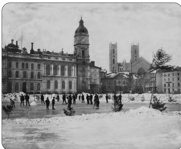
Alexander Henderson, Skating Rink, Montreal Harbour , about 1870. MP-1968.31.1.64, McCord Museum

In the latter part of his career, he photographed major national projects for railway companies. It was during this period that he travelled to Western Canada, where he captured the majestic views of the Rockies that are also part of the exhibition.