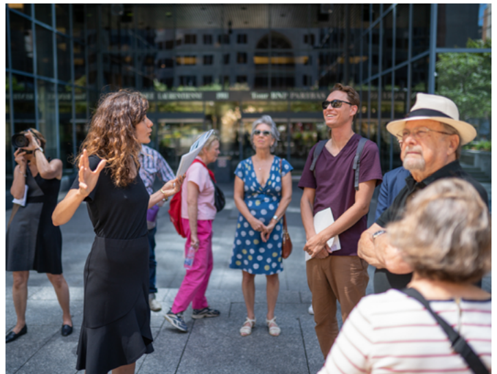
Historical tours