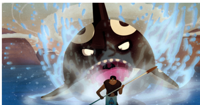
The Mountain of Sgaana © 2017 National Film Board of Canada. All rights reserved.

Details on all of the aforementioned activities are available on our Website .