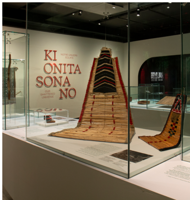
© Marilyn Aitken - McCord Museum