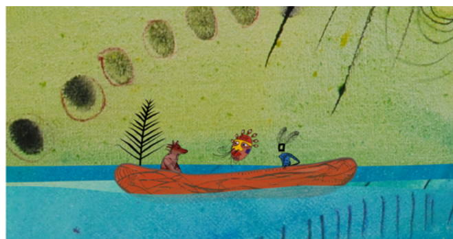
Vistas - Little Thunder