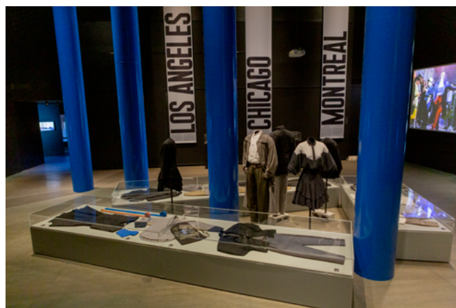
© Roger Aziz – McCord Museum