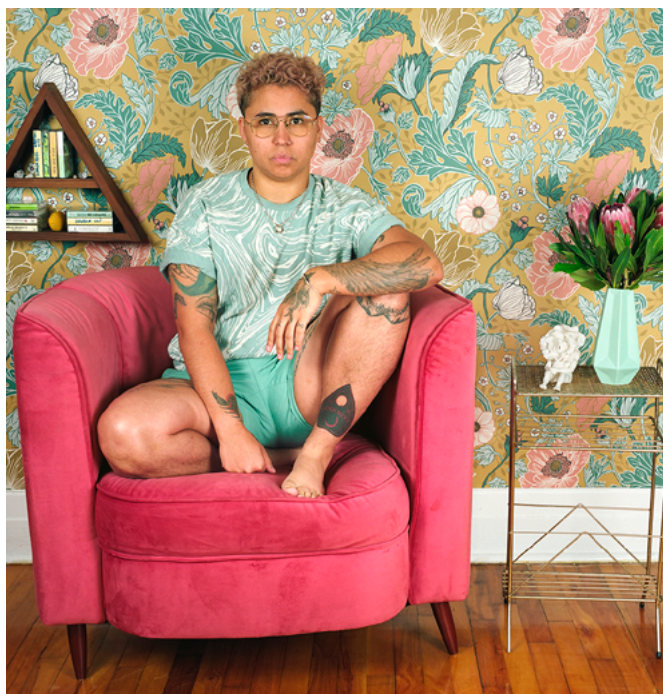
Miwa 2021

This exhibition has been produced with funding from the Aide aux projets pour le soutien des expositions permanentes program of the Québec Cultural Heritage Fund of the Ministère de la Culture et des Communications du Québec.