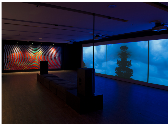
© Marilyn Aitken – McCord Museum