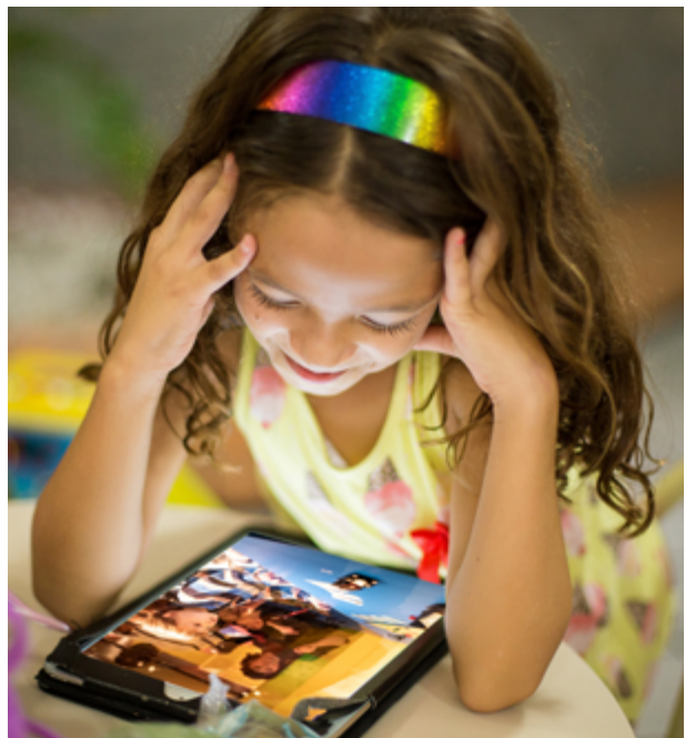
Workshop: What's on your mind?