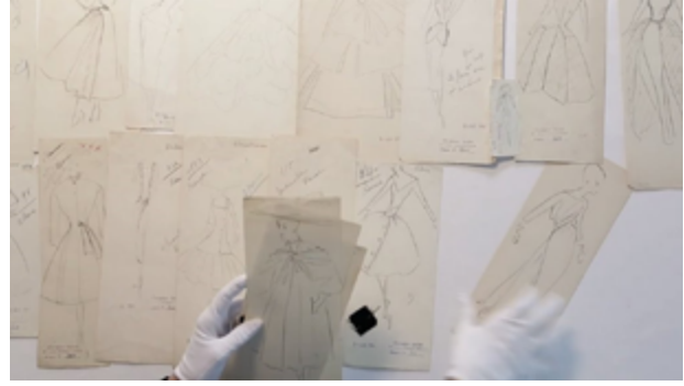
The Drawings of Christian Dior , 2017, Loïc Prigent.