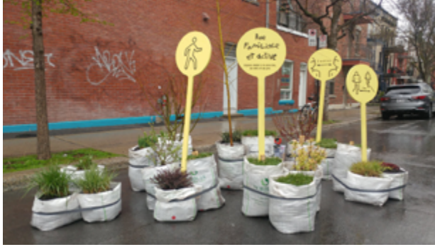
Community planning and health: street, neighborhood, metropolis