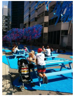
The Urban Forest, 2015 @ McCord Museum

The McCord Museum is offering a number of special activities, including the distribution of fruits and vegetables by Lufa Farms and teas by DavidsTea, and the launch of series of bimonthly swing dance workshops by Cat's Corner.