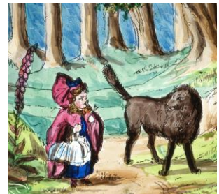
Hand painted glass lantern slide, The Red Riding Hood, 1855-1860.