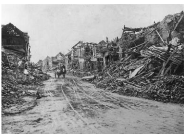
Sur la piste de Fletcher Wade Moses