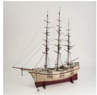
Model Ship 1875-1900

This exhibition about the famous Montreal smoked meat restaurant, which closed in 2006, brings together some 100 objects, including posters, architectural plans, photos, counter stools, dishes, utensils, and testimonials, from the McCord Museum's collections, that chronicle the life of this mythical place. Night and day, it attracted thousands of people from every walk of life who rubbed shoulders with celebrities – politicians Jacques Parizeau and Jean Charest, Mad Dog Vachon from the world of sports, poets and artists