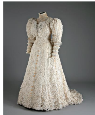
Wedding dress 1907 Battenberg lace over silk satin lining