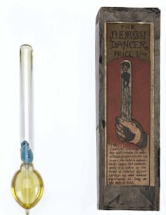
Toy, The Demon Dancer 1890-1910 Glass and volatile liquid mixture M996X.2.424.1-2