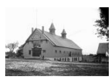
Haras National stables, Outremont, QC, 1889 Wm. Notman & Son 1889, 19<sup>th</sup> century II-90712 © McCord Museum