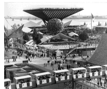
View of the Canadian Pavilion 1967

■ The second theme of the camp, Abracadabra! , will transport young participants to a world where reality and illusion are merged. Guided by a professional magician and assisted by a team of camp counsellors, the children will master a few tricks they'll proudly demonstrate during a show at the McCord Museum for parents and friends. They'll also create a promotional poster for their magic show inspired by those displayed at the exhibition ILLUSIONS – The Art of Magic . It goes without saying that campers will discover plenty about the history of Montreal at the turn of the 20th century, considered to be the golden age of the great magicians.